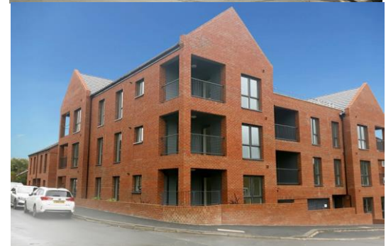
Elmshurst Crescent, before, during and after construction.