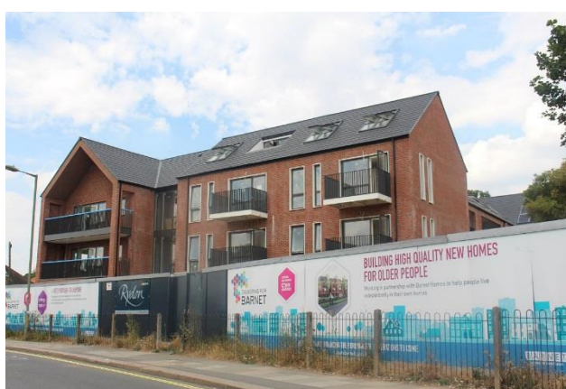
Ansell Court under construction

Barnet Homes has recently completed building a new 53-unit extra care scheme at Ansell Court (formerly Moreton Close NW7). This scheme has been designed with a focus on the needs of people living with dementia to meet the growing need for these services. Sites for two more extra care schemes have been identified and construction on these is expected to start in 2019, providing a further 125 properties.