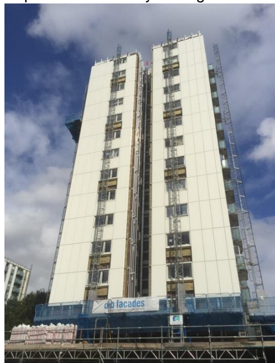
Cladding replacement works underway at Granville Road

Three blocks at Granville Road were identified as having been clad with Aluminium Composite Panels, which failed government fire safety tests. The council moved quickly to remove these panels and a non-combustible replacement cladding has now been fitted.