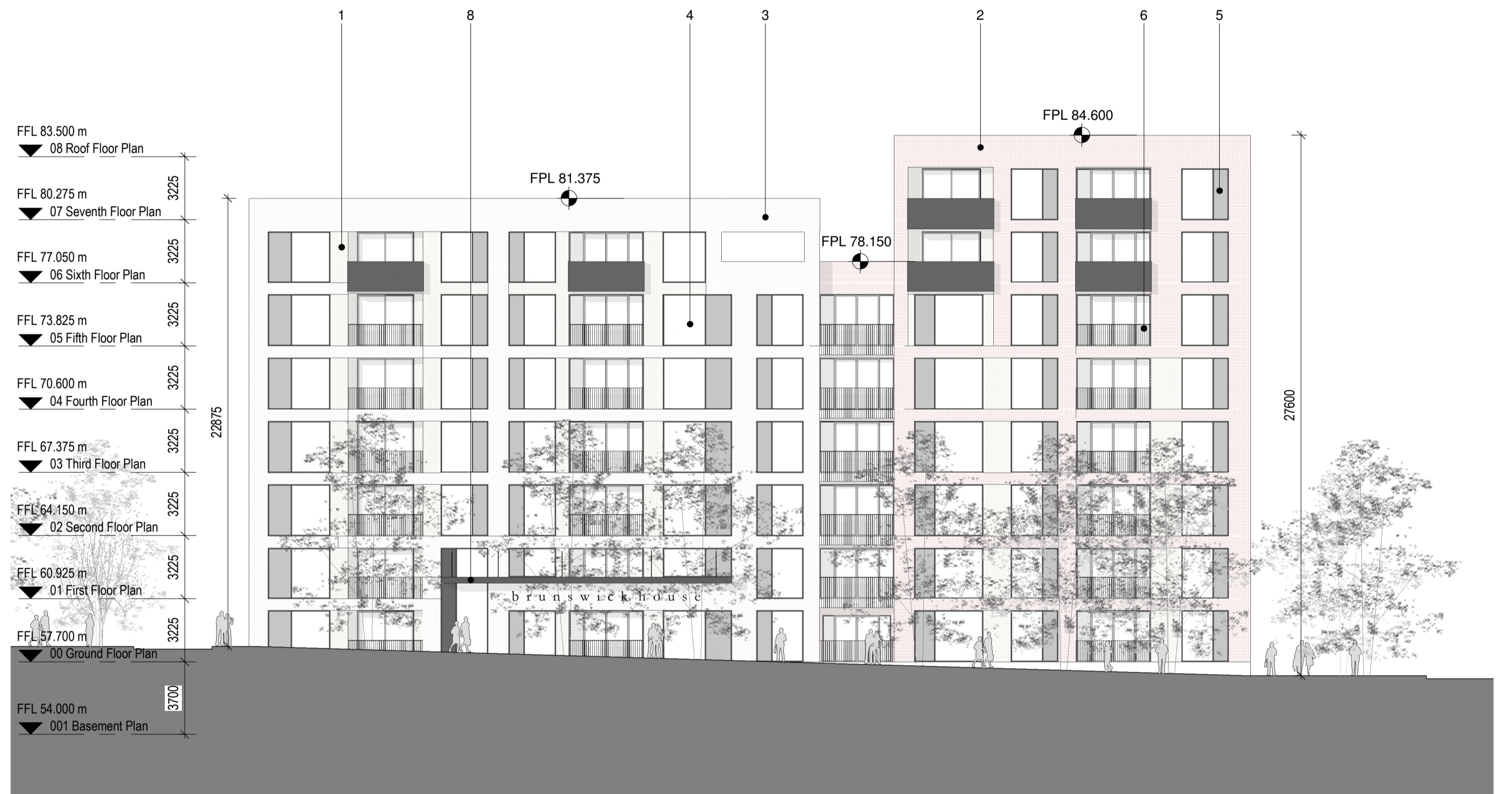
1 Block 1E_South Elevation 1 : 200