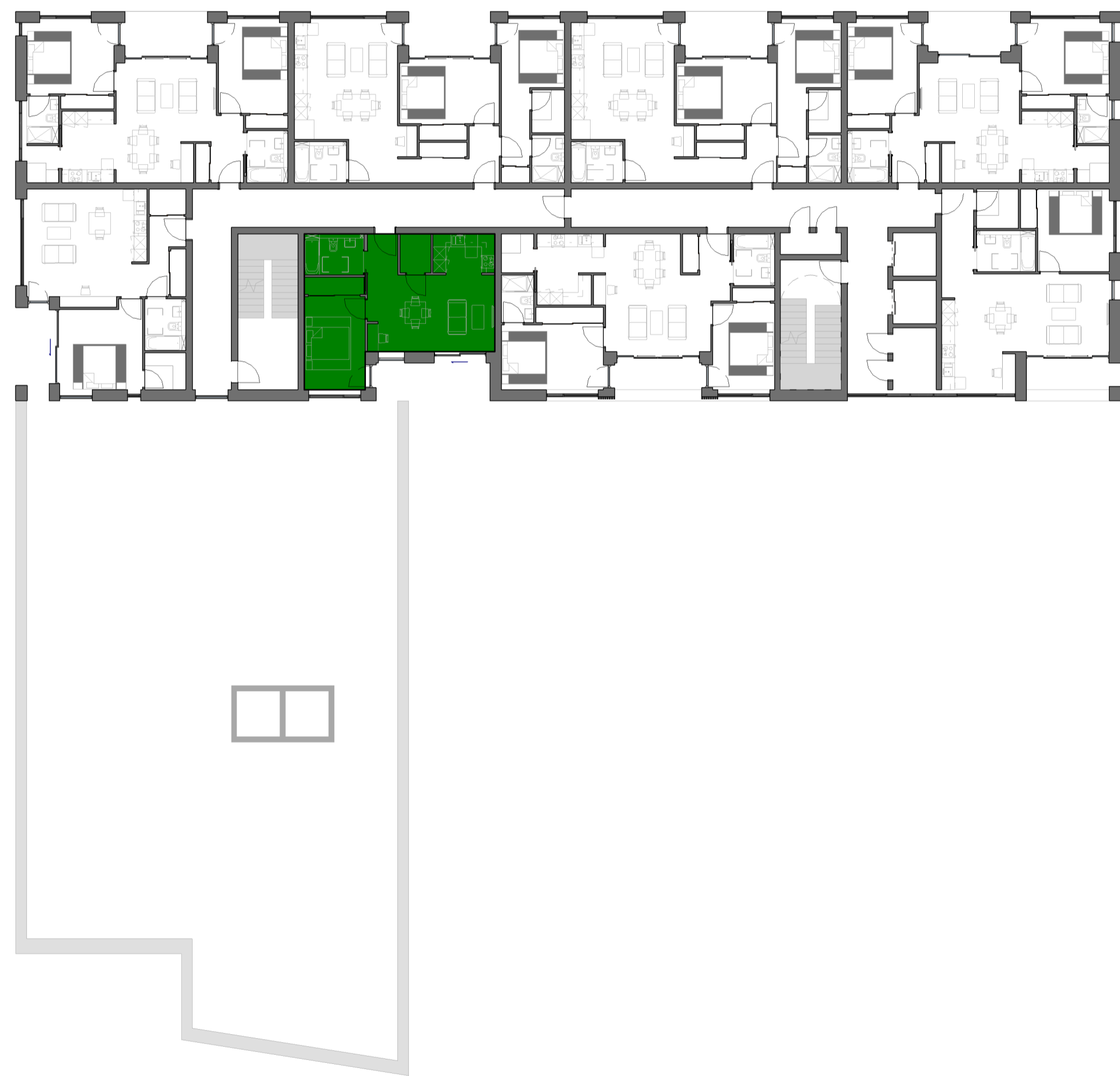
3 Block E_1 Bedroom Apartment Key Plan_Type 05 1 : 200