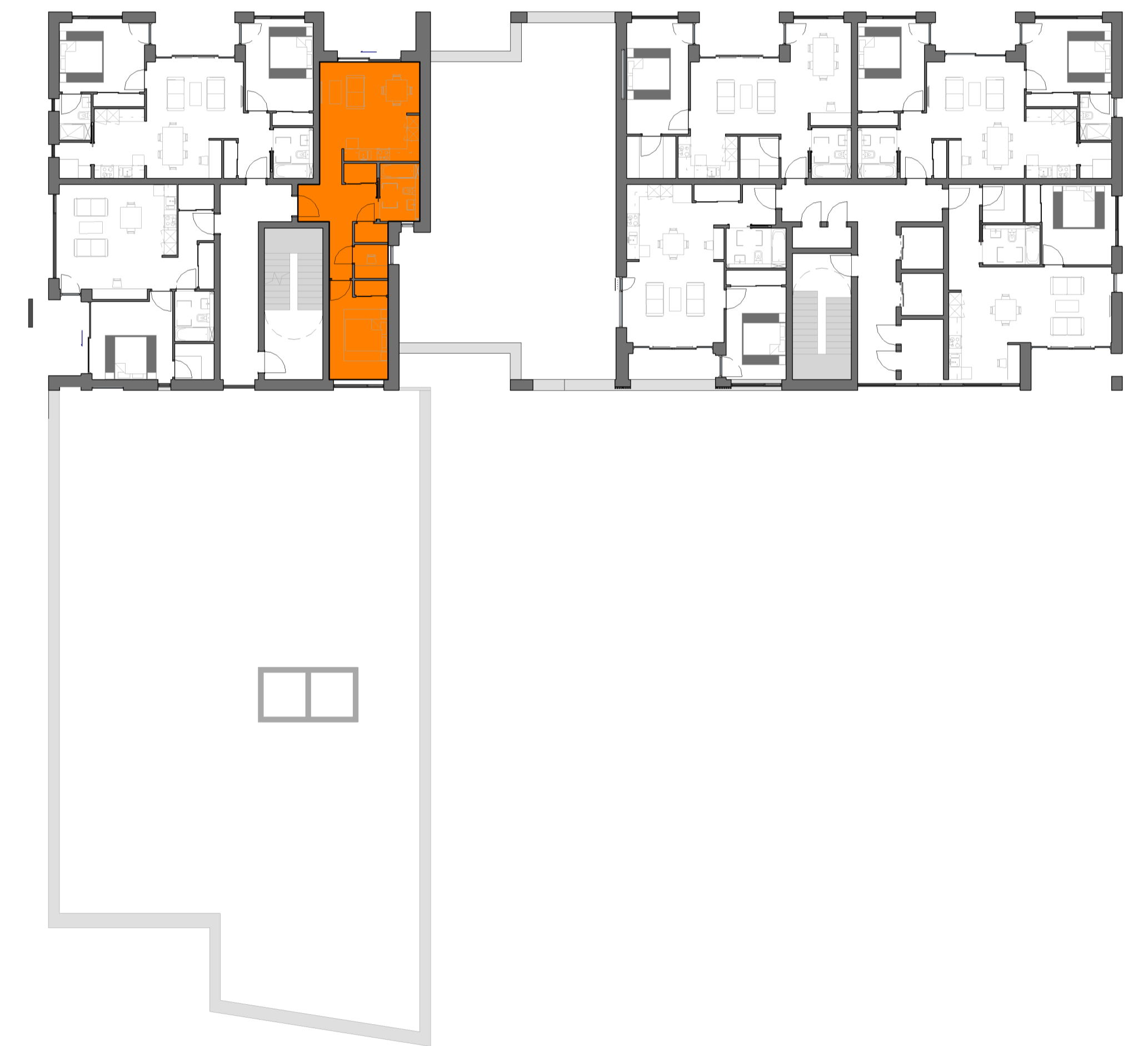
4 Block E_1 Bedroom Apartment Key Plan_Type 06 1 : 200