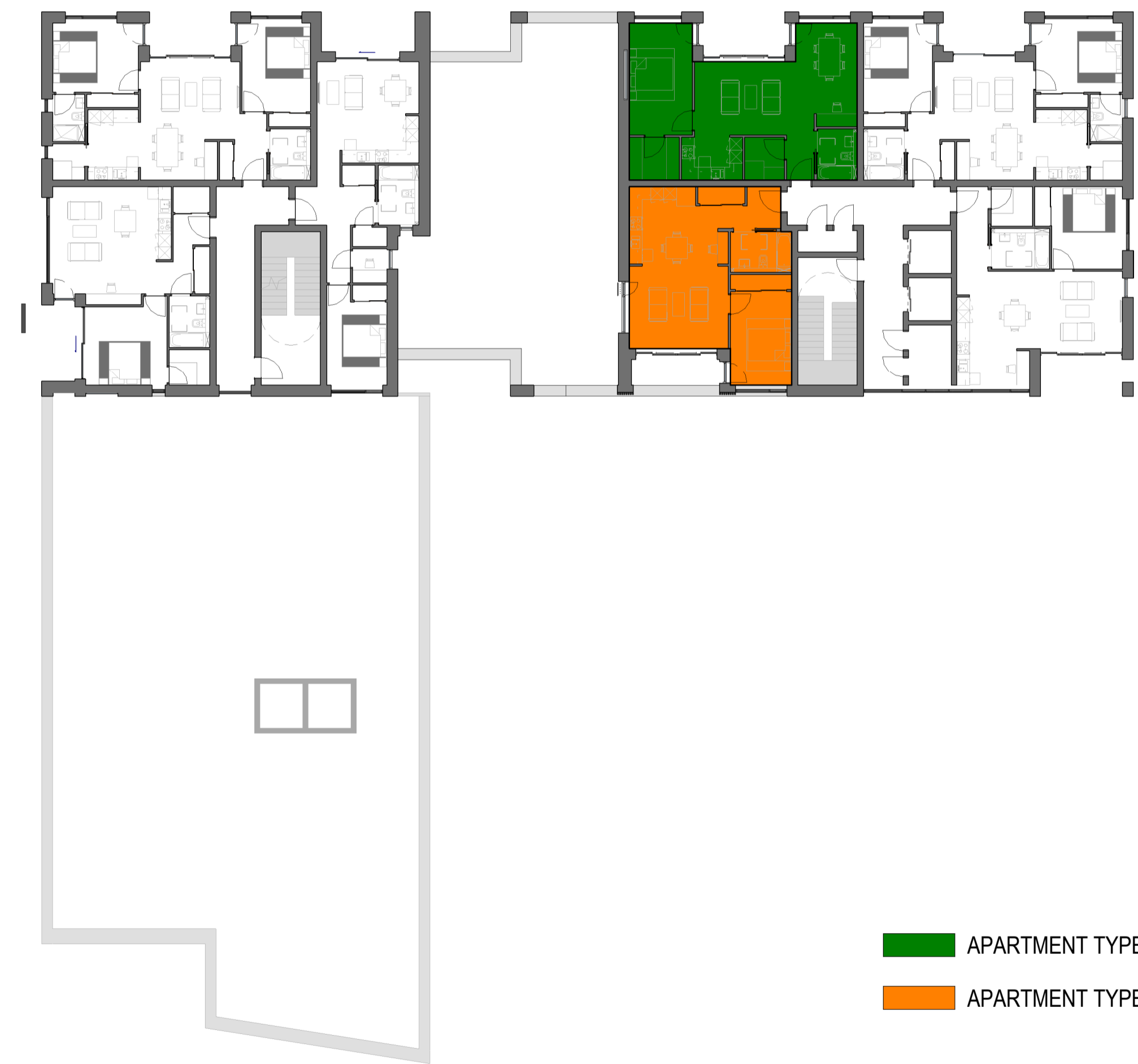
3 Block E_1 Bedroom Apartment Key Plan_Type 07 & 08 1 : 200