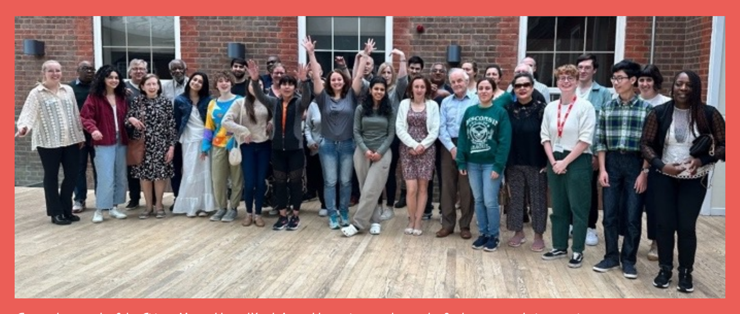
Group photograph of the Citizens' Assembly and Youth Assembly coming together at the final recommendations session