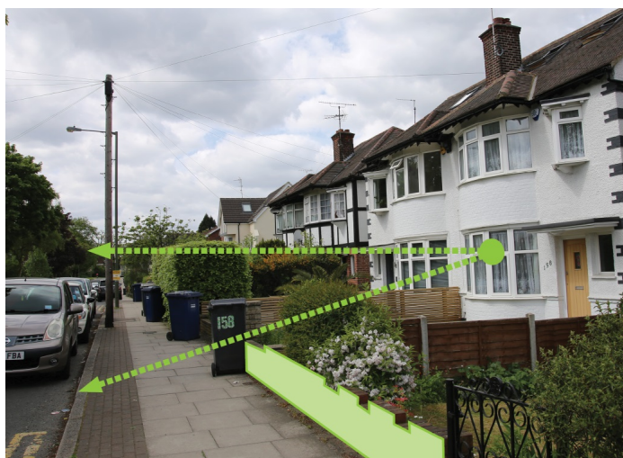
Low boundary treatments afford natural surveillance.

6.3 Reference should also be made to Policy RD2 of the Neighbourhood Plan.