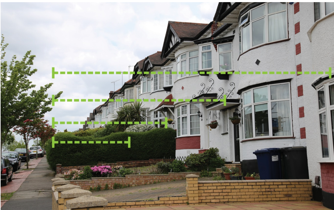
Consistent building line.