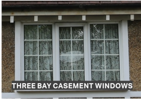
THREE BAY CASEMENT WINDOWS