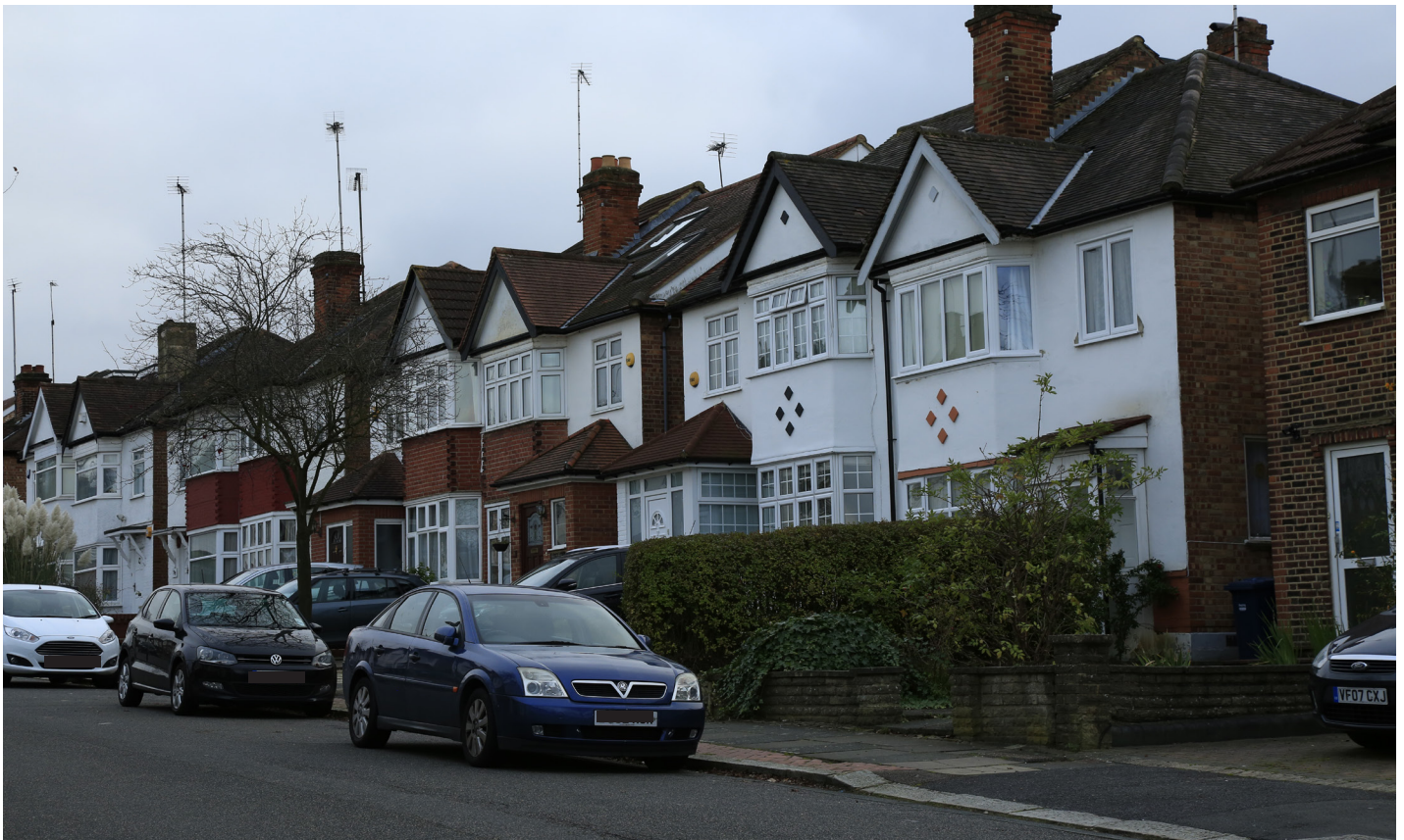
Nethercourt Avenue.