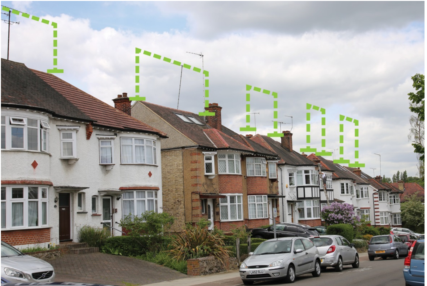
Consistent building width.