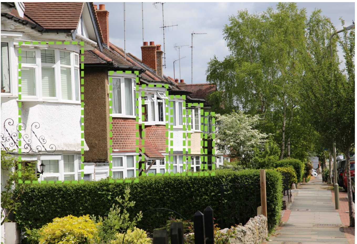
Regular frontal projections.

d. conversions should be designed in a manner that does not raise privacy issues or have an adverse impact on residential amenity.