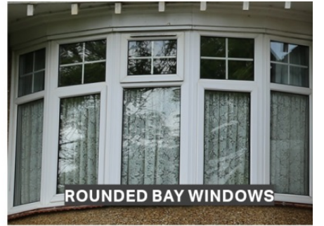
ROUNDED BAY WINDOWS