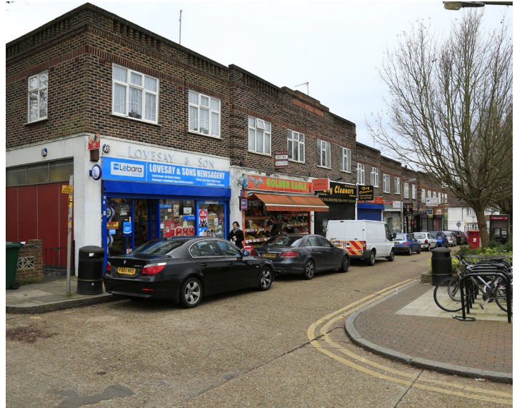
Shop frontages, North End