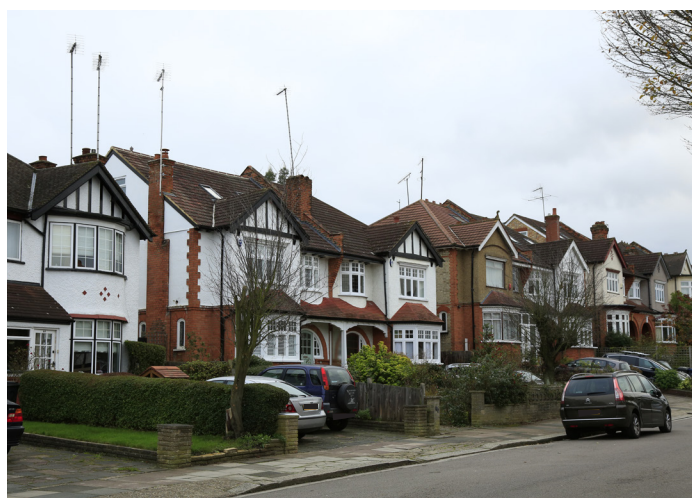
Westbury Road.