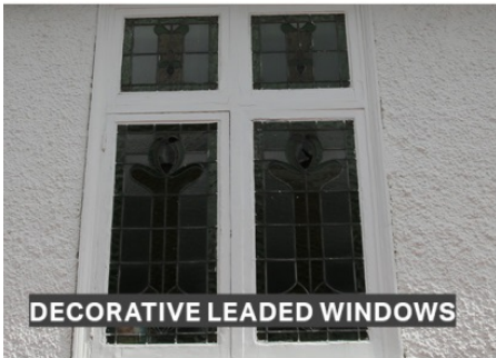
DECORATIVE LEADED WINDOWS