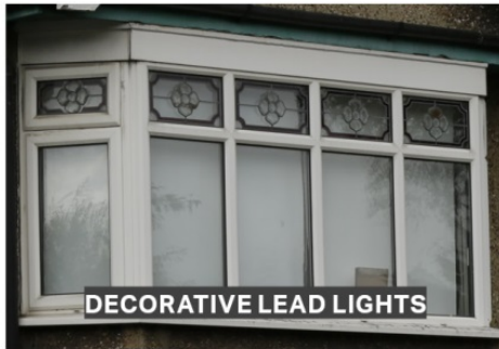
DECORATIVE LEAD LIGHTS