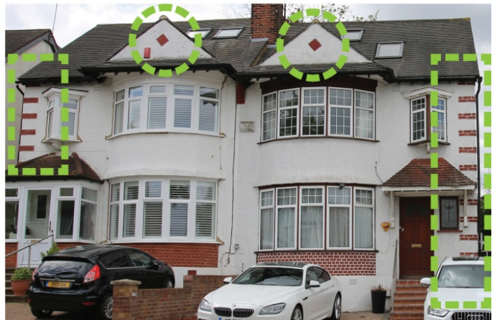
Architectural detailing.