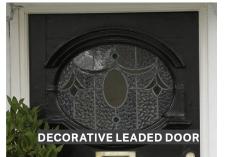
DECORATIVE LEADED DOOR