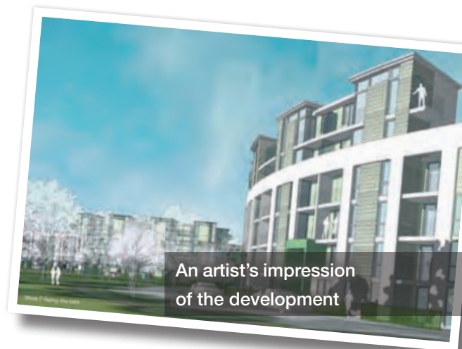
An artist's impression of the development