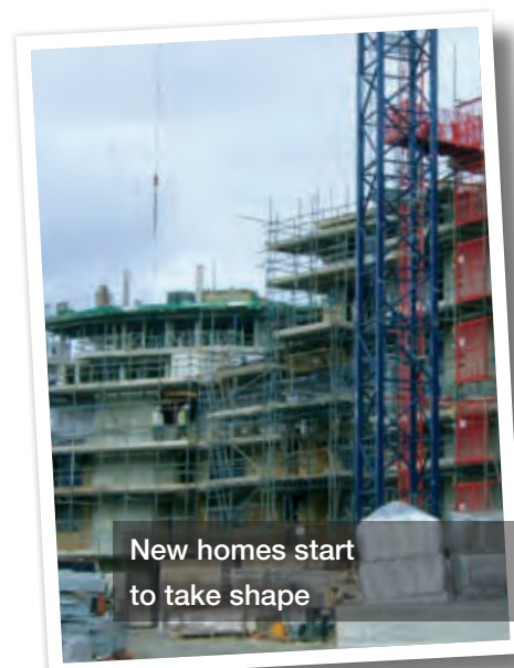
New homes start to take shape

The regeneration of the Grahame Park Estate forms a central part of the Colindale Action Plan which aims to create a vibrant new community with major infrastructure improvements, better transport links and community health facilities.