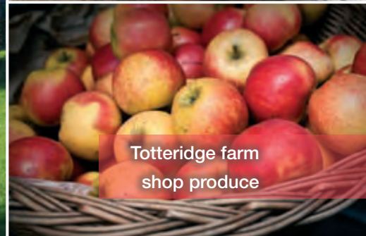
Totteridge farm shop produce