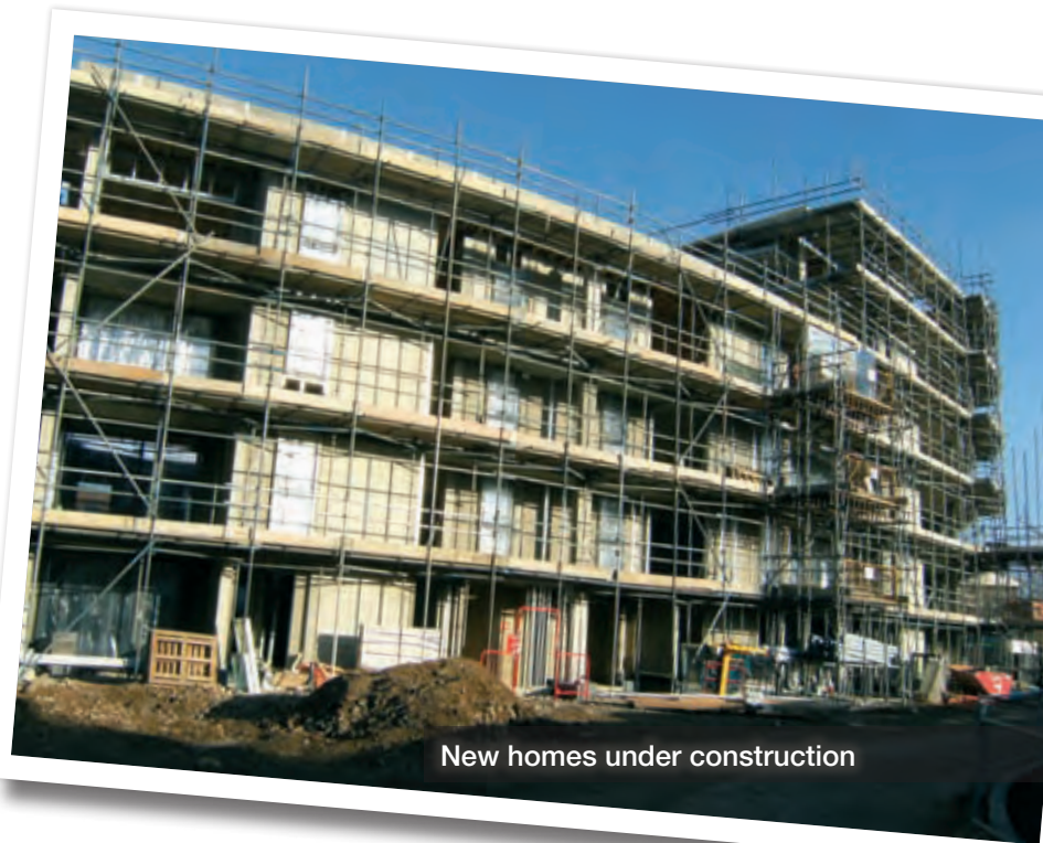
New homes under construction

"The new house is certainly the best present we could have ever received."