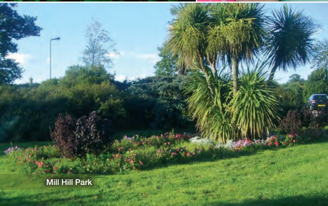
Mill Hill Park