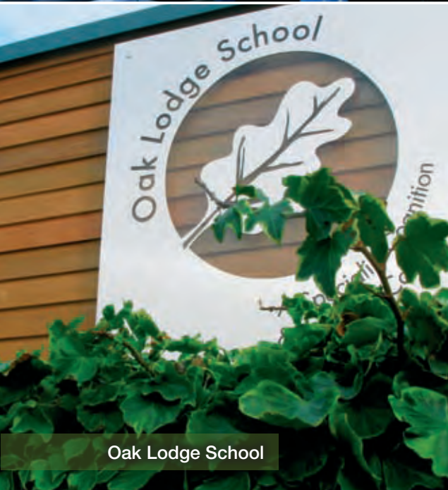
Oak Lodge School