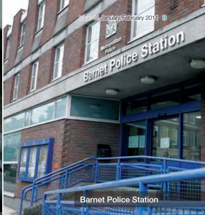
Barnet Police Station