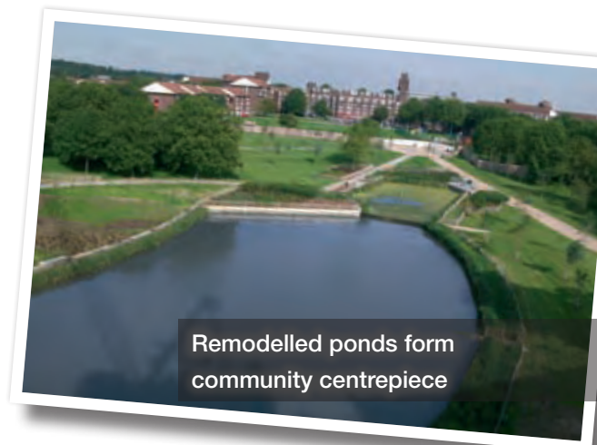
Remodelled ponds form community centrepiece