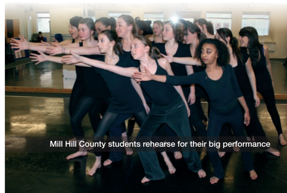
Mill Hill County students rehearse for their big performance

The Barnet Schools' Dance Festival takes place at the artsdepot between 8 and 12 March at 7pm each evening. To book tickets and for further information, call the box office on 020 8369 5454.