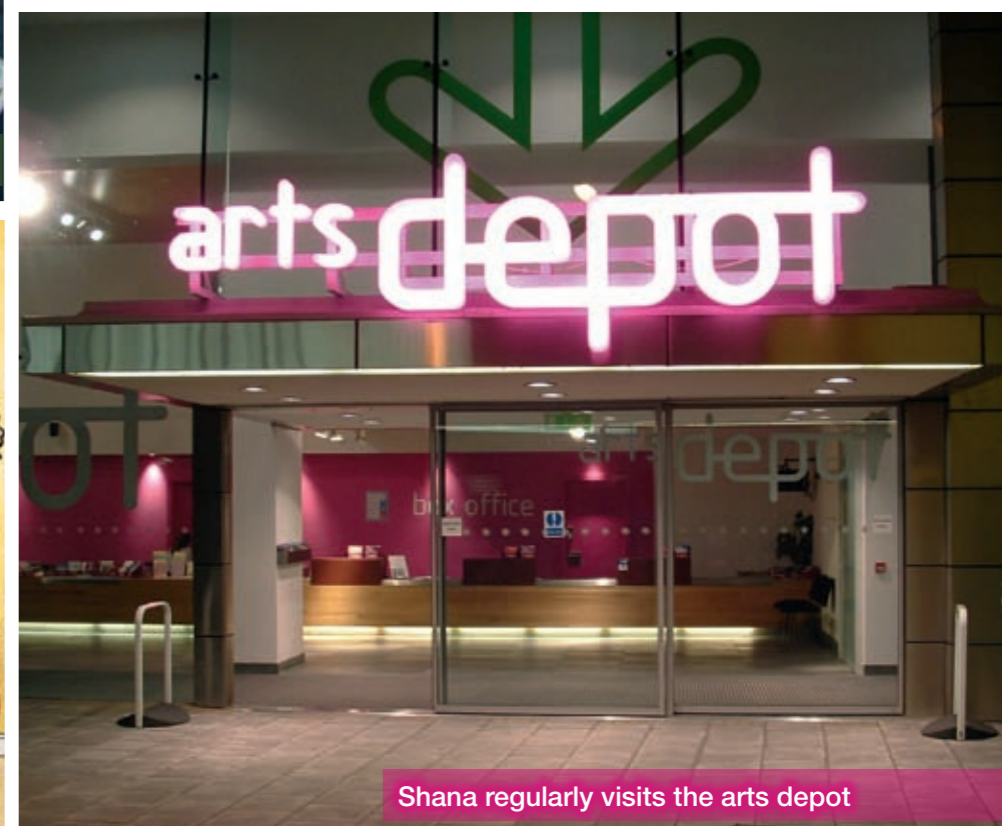
Shana regularly visits the arts depot