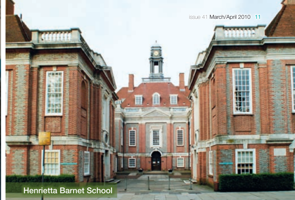
Henrietta Barnet School